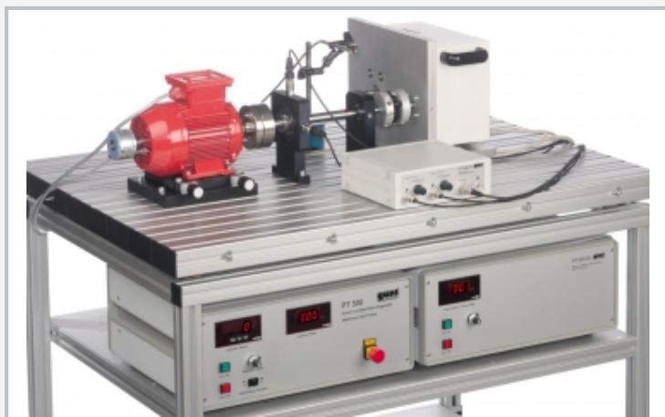
The illustration shows PT 500.13 together with PT 500, PT 500.01, PT 500.05 and PT 500.04.