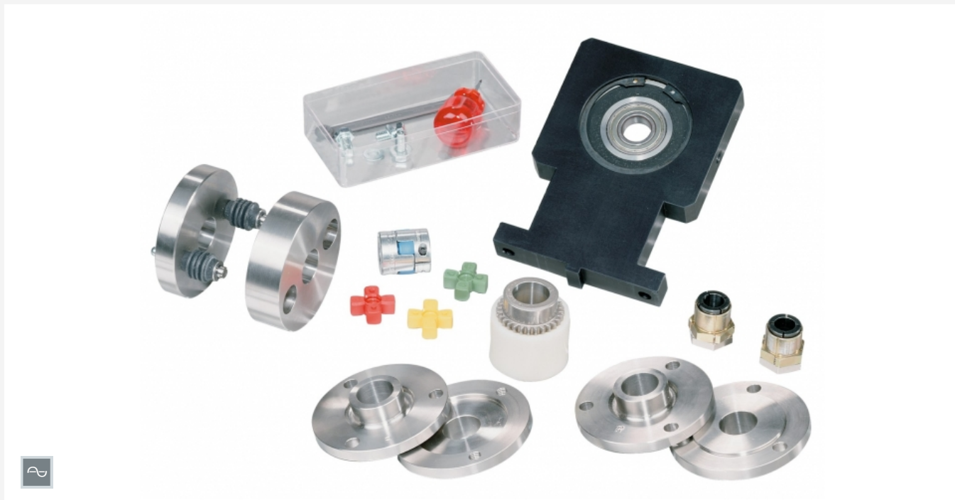
The illustration shows PT 500.13 together with the claw coupling of PT 500.