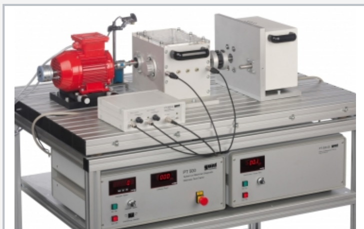
The illustration shows PT 500.15 together with PT 500, PT 500.01, PT 500.05 and PT 500.04.