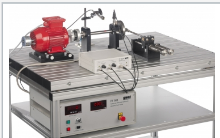
The illustration shows PT 500.16 together with PT 500, PT 500.01 and PT 500.04.