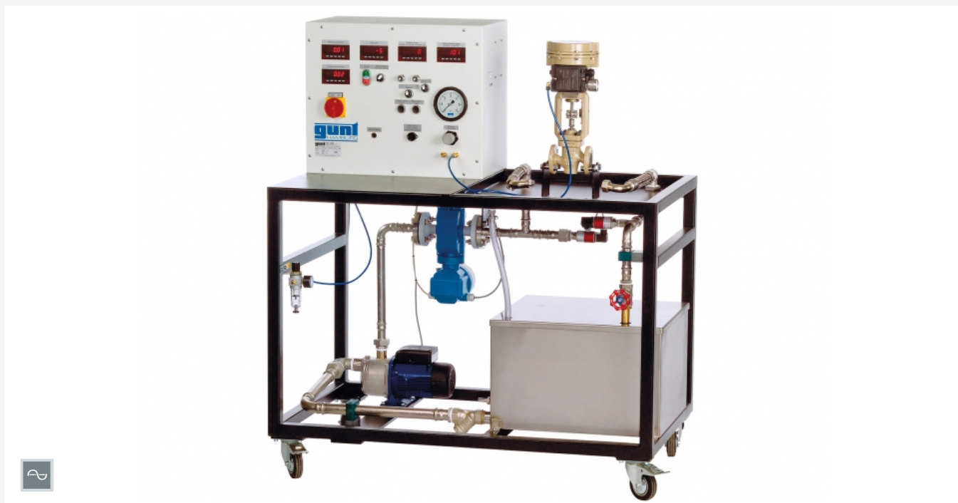
The illustration shows a similar unit with accessory RT 390.01.