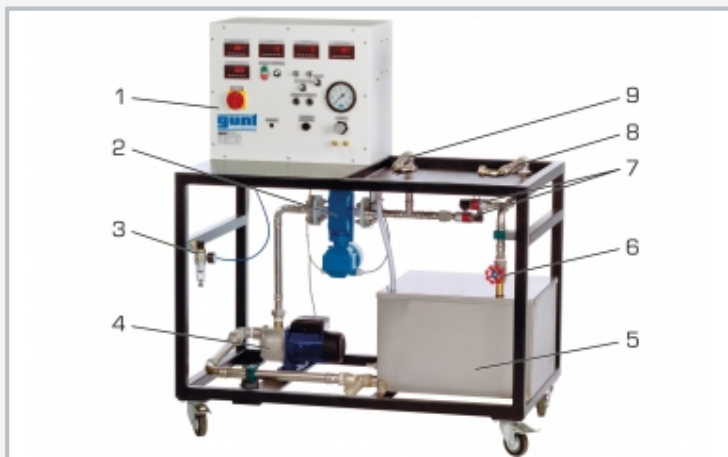
1 switch cabinet with controls, 2 flow rate sensor, 3 pressure reducing valve for air connection, 4 pump, 5 tank, 6 adjustment of flow rate, 7 pressure sensor, 8 outlet control valve, 9 inlet control valve