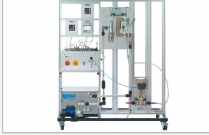
The illustration shows the layout of a temperature control system. In addition to the base module RT 450, it includes the following components: RT 450.04 (controlled system module: temperature), RT 450.11 (controller), RT 450.12 (recorder), RT 450.21 (control valve) and RT 450.36 (temperature sensor).

Process schematic for controlled system with heater as actuator and switching controller