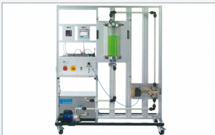
The illustration shows the layout of a level control system. In addition to the base module RT 450, it includes the following components: RT 450.01 (controlled system module: level), RT 450.10 (controller), RT 450.12 (recorder), RT 450.21 (control valve) and RT 450.35 (level sensor).