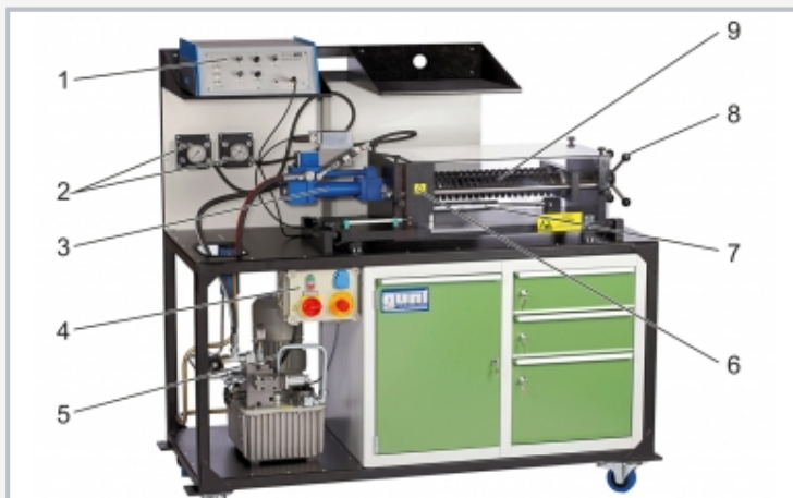
1 servo amplifier, 2 cylinder pressure manometer, 3 hydraulic cylinder with control valve, 4 switch box, 5 pump and oil tank, 6 carriage, 7 damper, 8 hand wheel for spring pre-tension, 9 springs