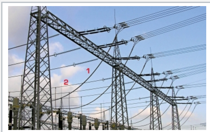
Free-hanging cables in practice (portal): 1 stay cable, 2 power line, similar to overhead line