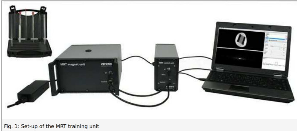
Fig. 1: Set-up of the MRT training unit