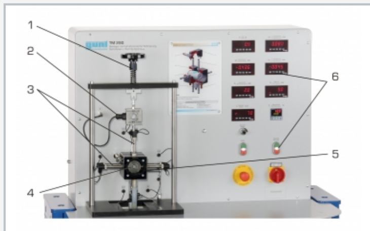
1 handwheel for load, 2 force sensor for frictional moment, 3 inductive displacement sensors, 4 shaft, 5 bearing housing, 6 displays and controls