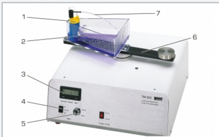
1 pump, 2 water tank, 3 speed display, 4 switch for direction of rotation, 5 speed adjustment, 6 rotating arm, 7 water jet