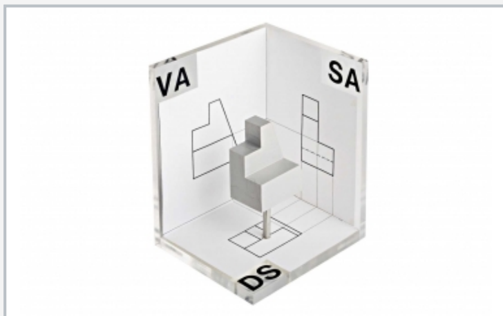
Room corner made of three Plexiglas planes with inlaid drawing and a prismatic model