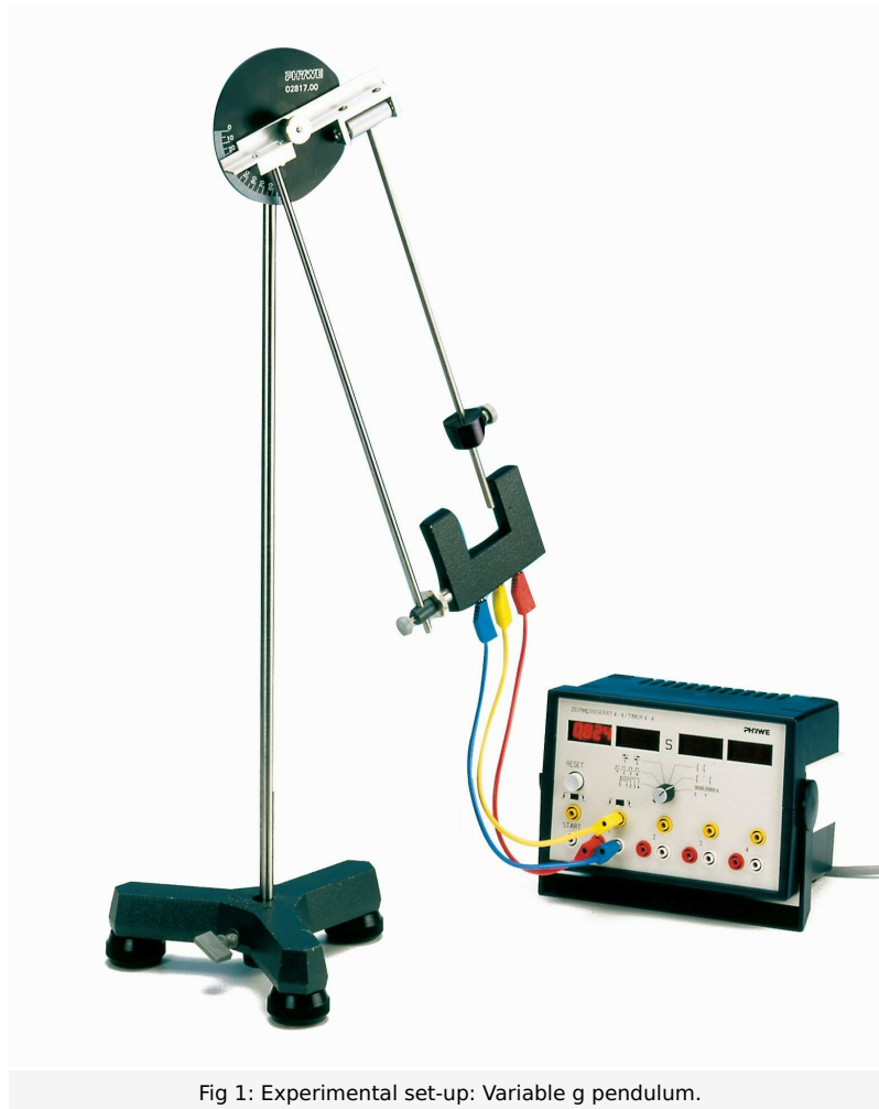
Fig 1: Experimental set-up: Variable g pendulum.