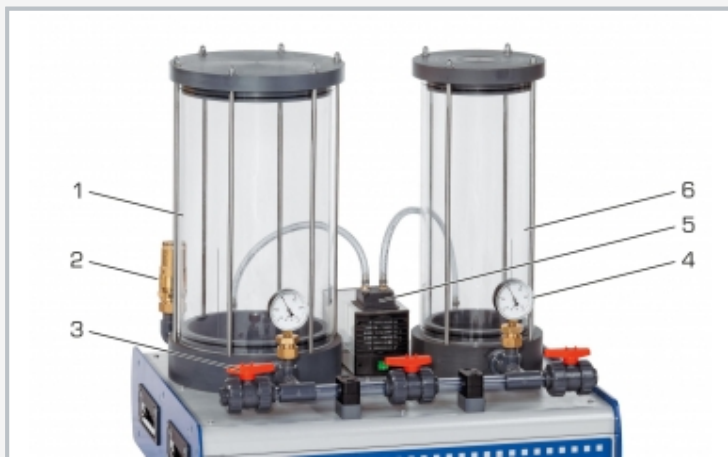
1 positive pressure tank, 2 safety valve, 3 ball valve, 4 manometer, 5 compressor, 6 negative pressure tank