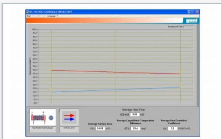
Software screenshot: temperature curve in cross parallel flow operation