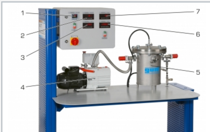
1 temperature controller with temperature display, 2 temperature display, 3 power display, 4 vacuum pump, 5 pressure vessel, 6 vessel's absolute pressure display, 7 vessel's relative pressure display