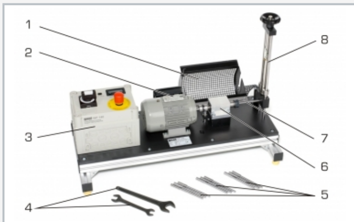
1 protective cover, 2 electric motor, 3 switch box, 4 tool, 5 specimens, 6 bearing, 7 clamped specimen, 8 load application device with spring balance and hand wheel