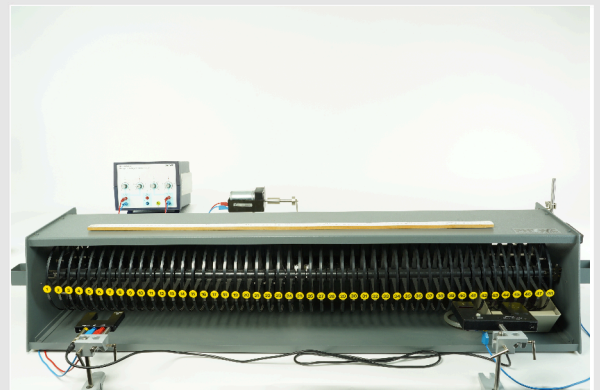
Fig. 1: Experimental setup

The damping system must be used to dampen reflections at the free end of the oscillating system. To do this, the attenuation bath is placed beneath the last oscillator and filled with water.