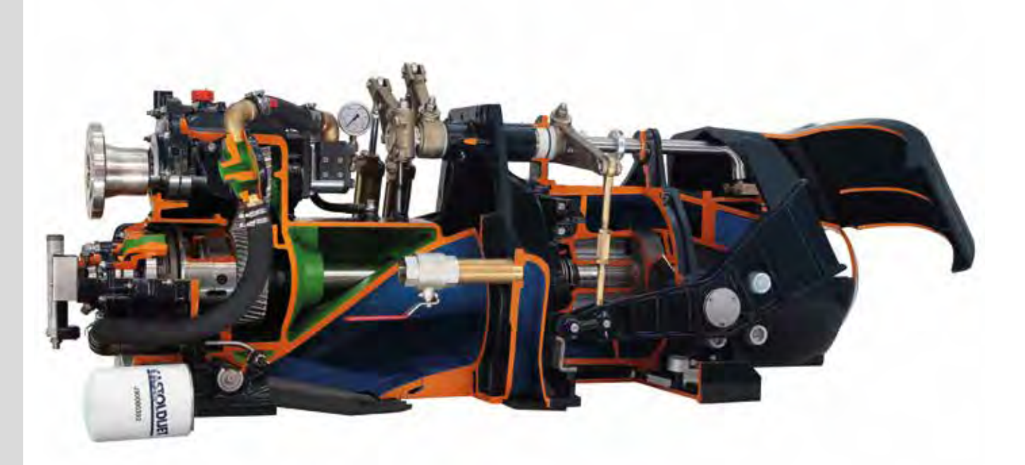
We do not produce the engine shown on this page. However we could process them, provided that the engines are supplied by our customers.